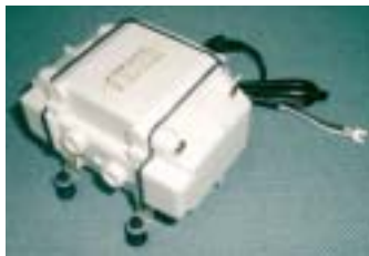
Model : 40LND 126(W)×95(D)×84(H)