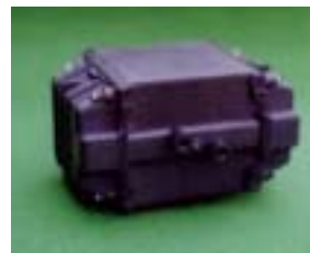
Model : 80LND 178(W)×129(D)×108(H)